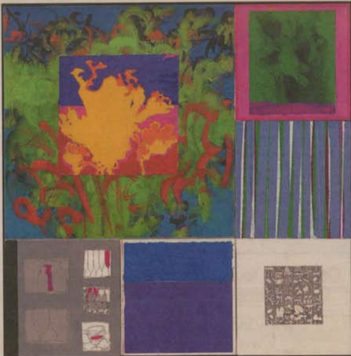
Additional mixed media from the artist who served at Keystone College for 40 years.

Neuroth is well known for his vibrant and colorful paintings in mixed media. His recent artwork combines multiple canvasses ranging in size from one foot to three feet square, featuring subjects that include floral displays, landscapes, still lifes and the human figure. Neuroth sometimes combines several